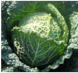
SAVOY HOTEL (Savoy)

KAMERON is a proven performer throughout Australia, offering a highly uniform product with a good large frame and excellent holding for main season production. It produces a large, flat, globe-shaped head at maturity and has low levels of off-types, which helps to ensure maximum field cut. KAMERON is approx. 100-120 days to maturity from transplant and has resistance to Black Rot (Xcc) and Fusarium Yellows (Foc).