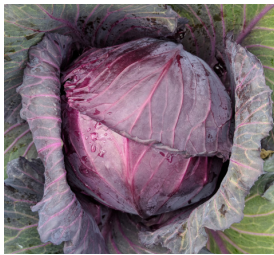
PORTELLO (Red Drumhead)

RED JEWEL is a medium size globe-shaped, red cabbage with an upright habit and dense heads. RED JEWEL has excellent uniformity, an attractive dark red colour and nice flavour. It has resistance to Black Rot (Xcc).