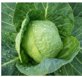
BONAPARTE (Mini Drumhead)

RESOLUTION is a Sugarloaf cabbage with early maturity (8-10 weeks). RESOLUTION has medium size heads with a sweet flavour, an attractive blue-green colour and good uniformity.