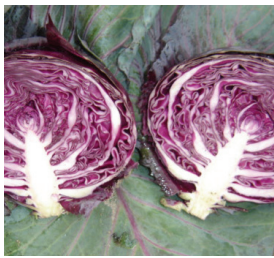
RED JEWEL (Red Drumhead)

SAVOY HOTEL is a semi-globe, slow bolting Savoy cabbage with vigorous growth and an upright outer leaf for winter/shoulder harvest. It is a mid-maturing variety which is very uniform and has a dark blue-green frame and head colour, with a yellow internal and a heavily blistered leaf. SAVOY HOTEL has resistance to Black Rot (Xcc) and Fusarium Yellows (Foc).