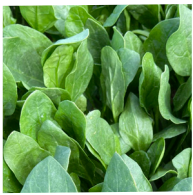
058-23 Bunching (Trial)

BLACK GLOVE 10 is a dark green and slightly savoyed, vigorous growing spinach. It features an upright plant habit with low lying cotyledons and good uniformity, with even growth. Recommended for sowing in late autumn, winter and early spring, BLACK GLOVE 10 has Downy Mildew (Pe) resistance and is a market leader for the bunching market and suitable for babyleaf if cut early.