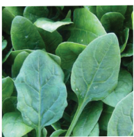
BLACK GLOVE 10

JINX is a high yielding, dark green spinach suitable for cool season babyleaf production. The leaf is slightly cupped and savoyed with an oval shape, and an upright growth habit making it easy to harvest. The upright growth also assists air movement through the crop, enabling a healthy plant growth and high yield. JINX performs well during periods of high rainfall, maintaining it's dark green colour, and has some resistance to Downy Mildew (Pe).