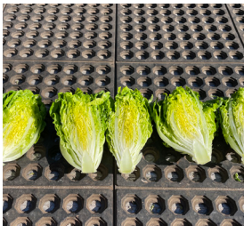
040-22 Mini Green (Trial)

FLORENCE is a light green Gem variety for yearround production, with excellent uniformity and a medium blistered leaf. FLORENCE has shown excellent tipburn and bolting tolerance in plantings to date with a short core and good head weight/ density. It has a light green-yellow internal whilst the outer leaf offers good gloss and crispness. FLORENCE is approx. 14cm in height and is an ideal variety for multi-packs with minimal trim required. It has resistance to Downy Mildew (Bl).